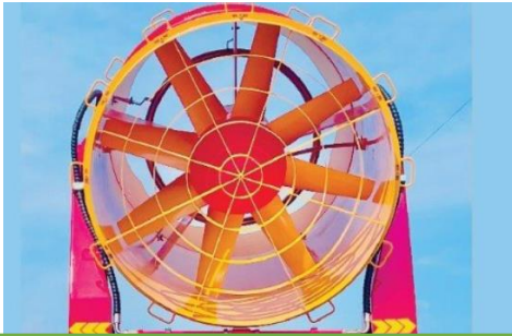
SMOKE EXHAUST FAN SYSTEM Wind Flow: 220,000 m 3 /h

Office: No 42-D5B, Lane 679 Lac Long Quan Street, Phu Thuong Commune, Tay Ho, Hanoi 100000, Vietnam Tel: 04.3773.6038 / Fax: 04.37731962 Email: office@hiephoa.com.vn