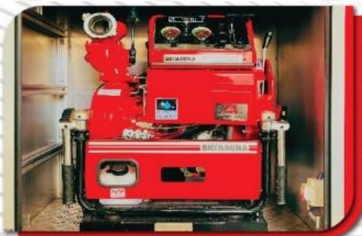
Shibaura hand-carrying fire pump