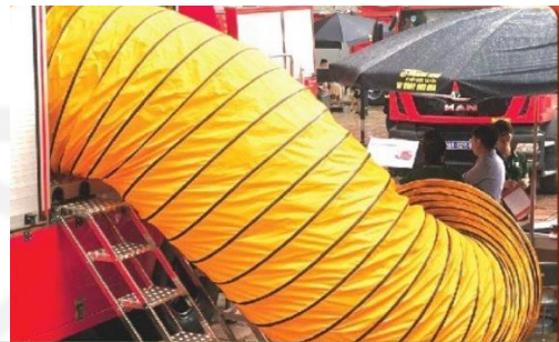
BIG SIZE SMOKE EXHAUST HOSE D1400 Fresh air ventilation duct, Length of hose: 10-50m