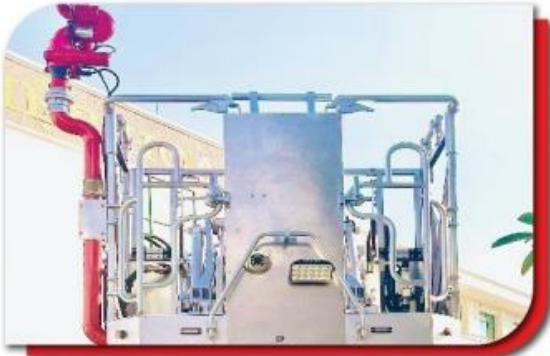
Ladder bucket system (bear loading weight \leq 350 kgs)

Office: No 42-D5B, Lane 679 Lac Long Quan Street, Phu Thuong Commune, Tay Ho, Hanoi 100000, Vietnam Tel: 04.3773.6038 / Fax: 04.37731962 Email: office@hiephoa.com.vn