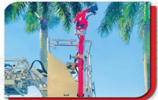
Monitor integrated on the bucket