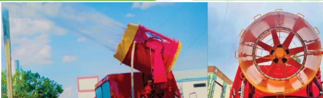
SPRAYING FIRE FIGHTING SYSTEM Nozzle system jets from distance 40-70m with flow 2800-3000 l/minutes to create low temperature protection area and fresh air for fireman to access the scene.