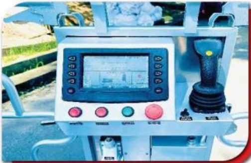
Control panel on the bucket