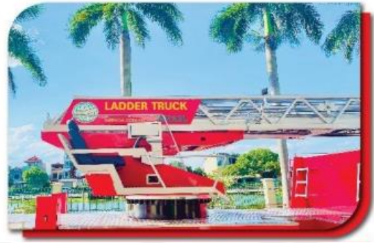
Ladder controlling chair