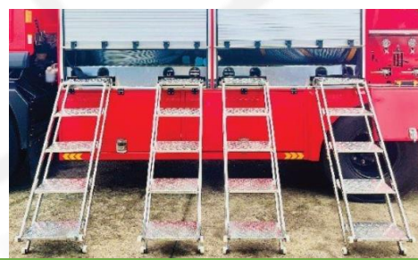
FOLDING STAIR Support to take equipments from the trunk. Foldable in the trunk.