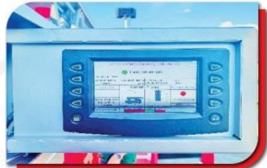
The main control panel