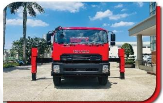
Front and back beam prop system (H Style)