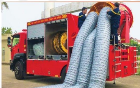
SMALL SIZE SMOKE EXHAUST HOSE D500 The hose is heat-resistant up to 400°C and flame retardant. Length of hose line: 10-30m